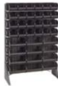
QRU-16SCO (Bins sold separately)