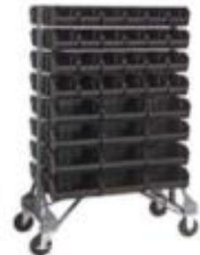
QRU-16DCO + QRU-MOBSCO (Bins sold separately)