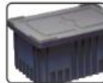
Snap On Covers