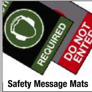
Safety Message Mats