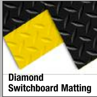
Diamond Switchboard Matting