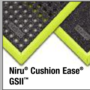
Niru® Cushion Ease® GSII™