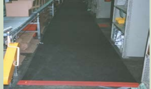
Ortho I Molded Material with Antimicrobial